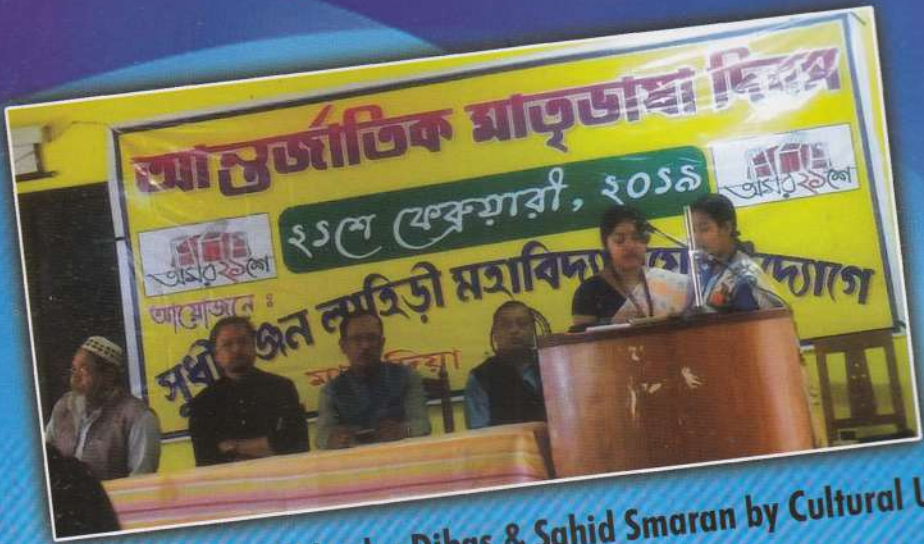
● Antorjatik Matribhasha Dibas & Sahid Smaran by Cultural Unit.