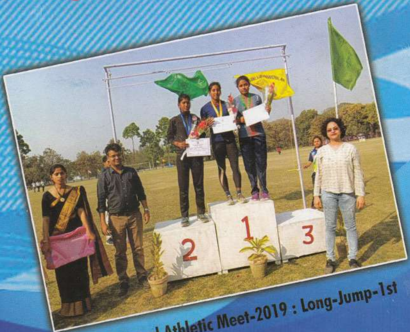
● KU Annual Athletic Meet-2019 : Long-Jump-1st