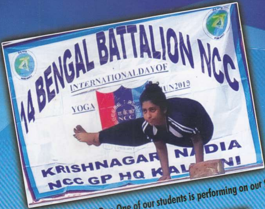
● International YOGA Day. One of our students is performing on our Stage.