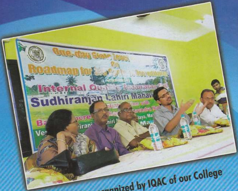
● Workshop organized by IQAC of our College