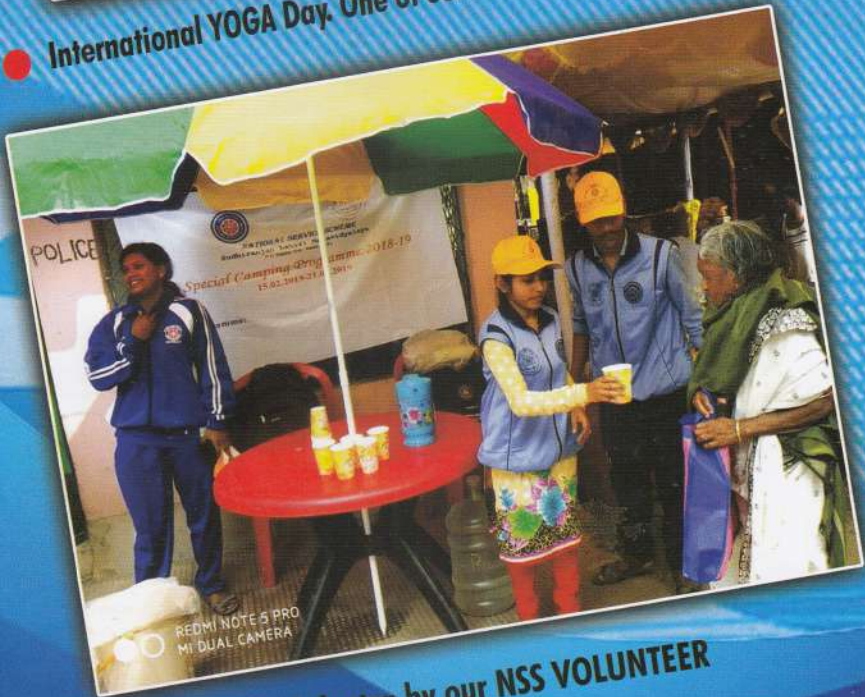
● Jalsatra by our NSS VOLUNTEER